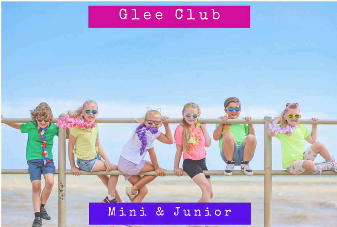
Mini & Junior