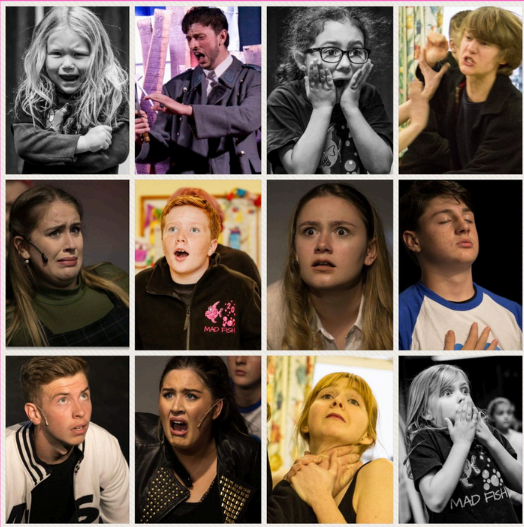
Mad Fish Performing Arts