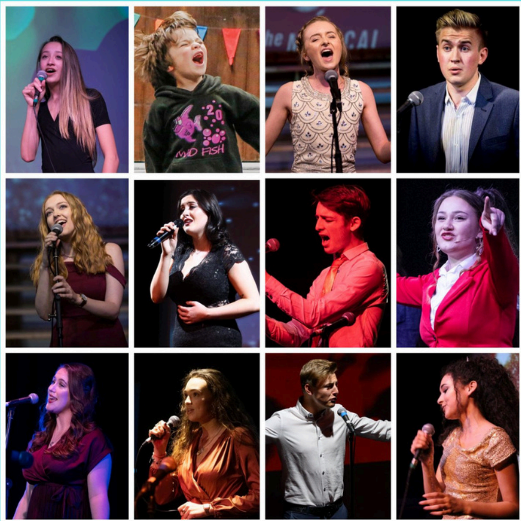
Mad Fish Performing Arts